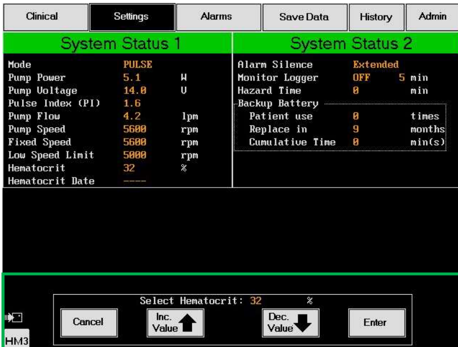
Figure 2 – Example of Expected Appearance of the Screen