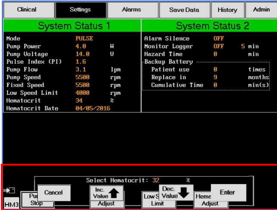
Figure 1 – Example of Atypical Screen Behavior, Overlapping Buttons