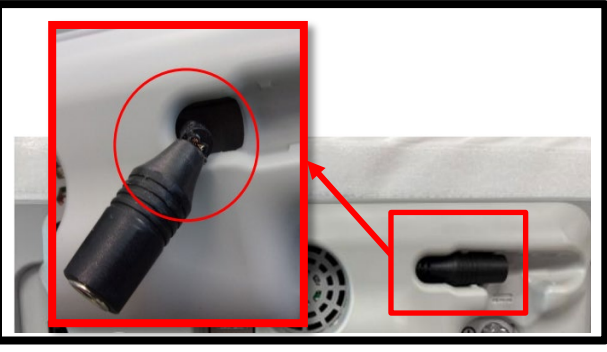
Figure 1: Back of PES