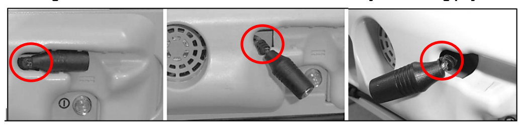
Figure 3 Examples of Damage to the connector plug