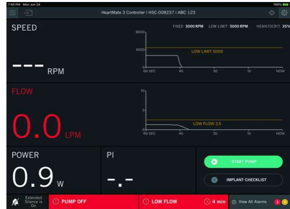
Figure 3: Clinical view after the completion of the “STOP PUMP” sequence.