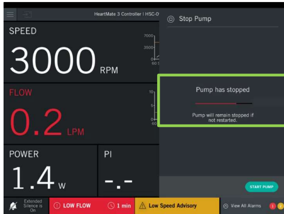
Figure 2: “STOP PUMP” red progress bar display on the black line indicating sequence is IN PROGRESS . Do not disconnect System Controller or Wireless Adapter.