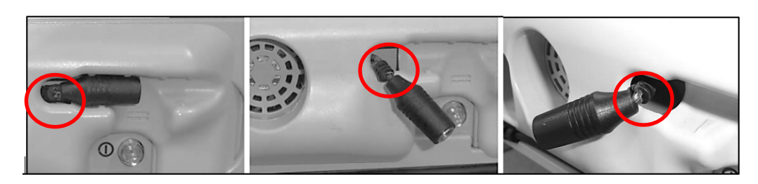
Figure 1: Example of power connector plug damage

Abbott is notifying clinicians of an issue with the CardioMEMS Patient Electronics System (PES), specifically those manufactured from December 2017 onward that include the power connector plug housed in the connector cover in the back of the device. Importantly, it is safe for patients to continue using their device when the power connector plug is undamaged and properly connected to the power adapter cable secured to the back of the PES. Examples of power connector plug damage are shown in Figure 1: