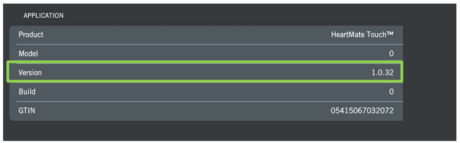
Figure 1: "About" view showing HeartMate Touch Software Version

When the "STOP PUMP" sequence needs to be performed, please follow the instructions in the Instructions For Use (IFU), Chapter 4 HeartMate Touch<sup>TM</sup> Communication System, Pages 4-59 to 4-60. The user <u>can</u> <u>prevent</u> the unintentional LVAD start/stop from occurring by following the IFU and these additional guidance and recommendations. Note that communication may also be interrupted if the Wireless Adaptor is disconnected from the HeartMate Touch system prior to completion of the "STOP PUMP" sequence.