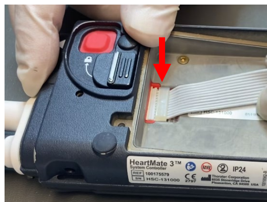
Figure 1: Connection of Backup Battery Ribbon Cable

In the confirmed complaints, Abbott identified corrosion at the connection point between the System Controller and the Backup Battery ribbon cable. This can be caused by excessive handling and movement of the ribbon during Backup Battery installation or replacement, specifically at the ribbon cable connection interface, see Figure 1.