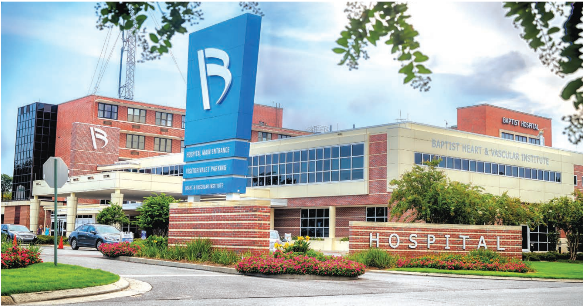
Figure 2: Baptist Heart & Vascular Institute at Baptist Hospital in Pensacola, Florida.