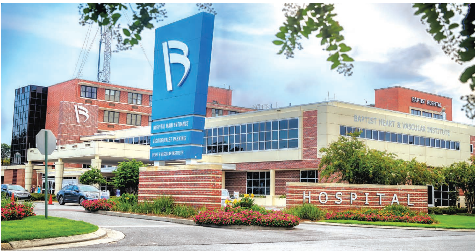
Figure 2: Baptist Heart & Vascular Institute at Baptist Hospital in Pensacola, Florida.