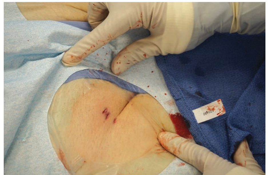
Figure 4: Immediately after VCD deployment (Perclose ProGlide Suture-Mediated Closure System, Abbott Vascular).

and comorbidities did not influence the ability to achieve same-day discharge. 4