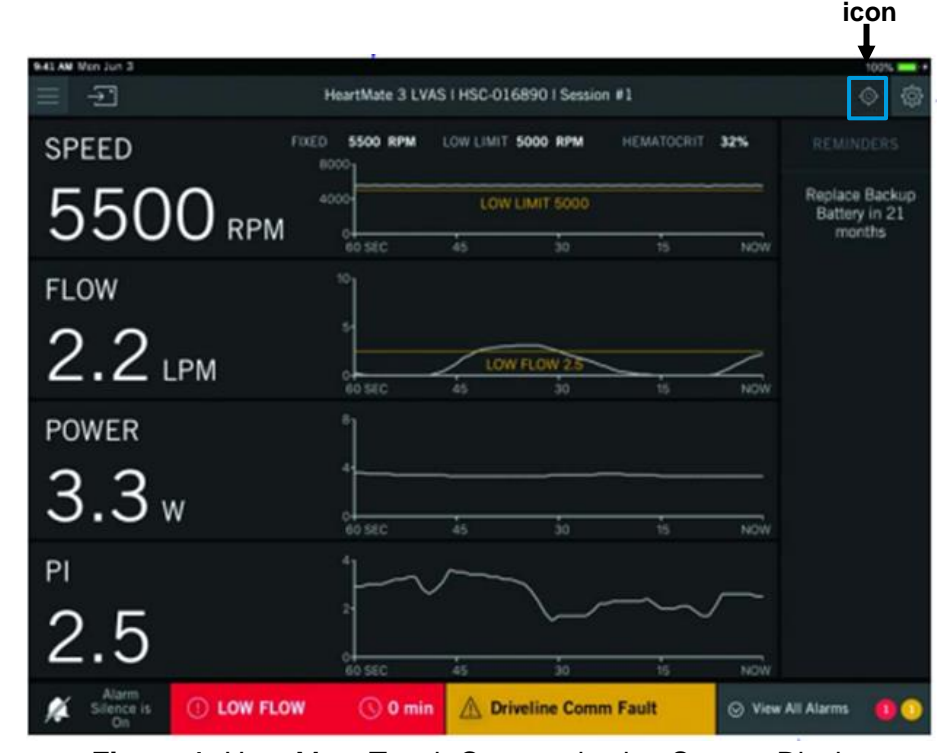
Figure 1: HeartMate Touch Communication System Display

Tap on the 'Locate' icon on the top right corner of the HeartMate Touch Communication System display.