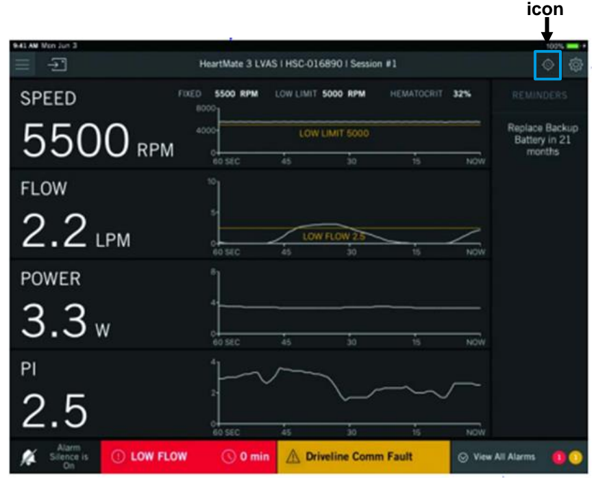
Figure 1: HeartMate Touch Communication System Display

Tap on the 'Locate' icon on the top right corner of the HeartMate Touch Communication System display.