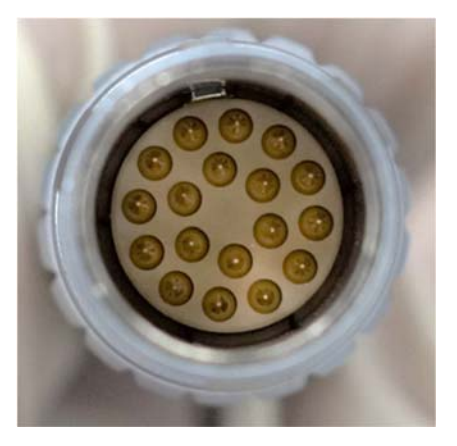
Figure 2: Motor Connector Pin View

Note: If there are any issues while connecting the CentriMag Motor to the CentriMag Console, inspect the Motor port on the rear of the Console for damage, particularly for any broken pins that may be lodged inside.