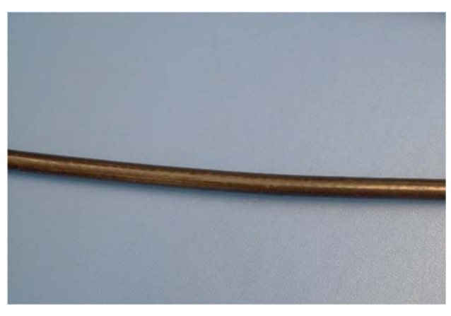
Figure 6: Undamaged and Intact Motor Cable