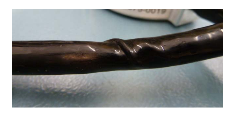
Figure 7: Damaged Motor Cable