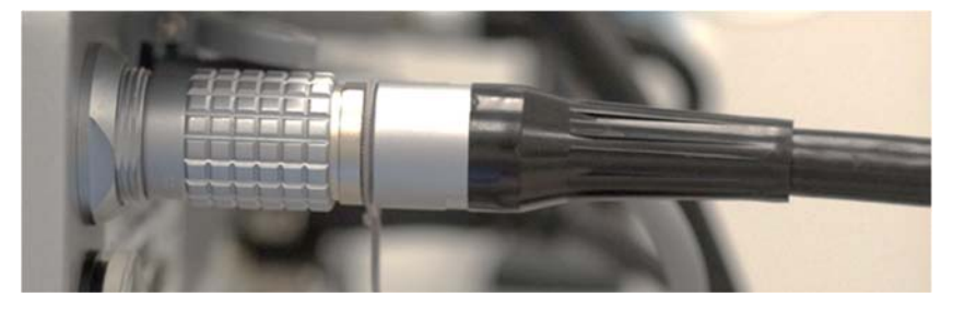
Figure 3: Cable Bend Relief at the Console Connector

2. Visually inspect the entire length of the CentriMag Motor cable, including both bend reliefs (see Figures 3 and 4), for any damage such as separations of the bend reliefs, deformations, kinks, or cuts. These types of damage indicate wear and tear or previous rough handling of the cable, which has the potential to result in internal wire damage. Cable thickness and shape should be uniform throughout the length of the cable.