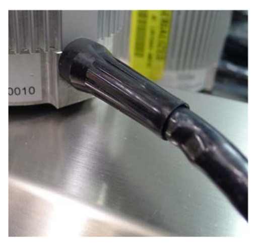
Figure 5: Cable Damage at the Motor Bend Relief