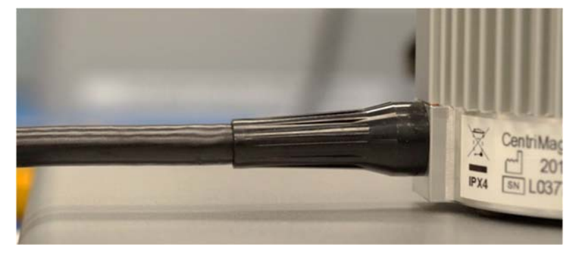
Figure 4: Cable Bend Relief at the Motor Appendix 3: Visual Inspection for Cable Damage (cont'd)