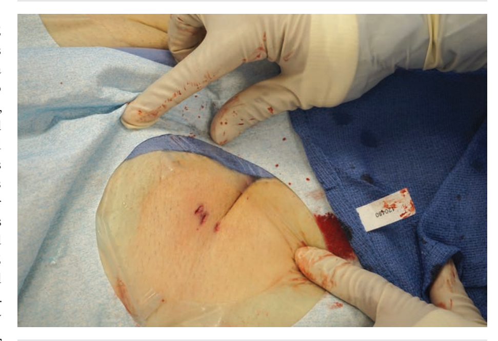
Figure 4: Immediately after VCD deployment (Perclose ProGlide Suture-Mediated Closure System, Abbott Vascular).

and comorbidities did not influence the ability to achieve same-day discharge.<sup>4</sup>