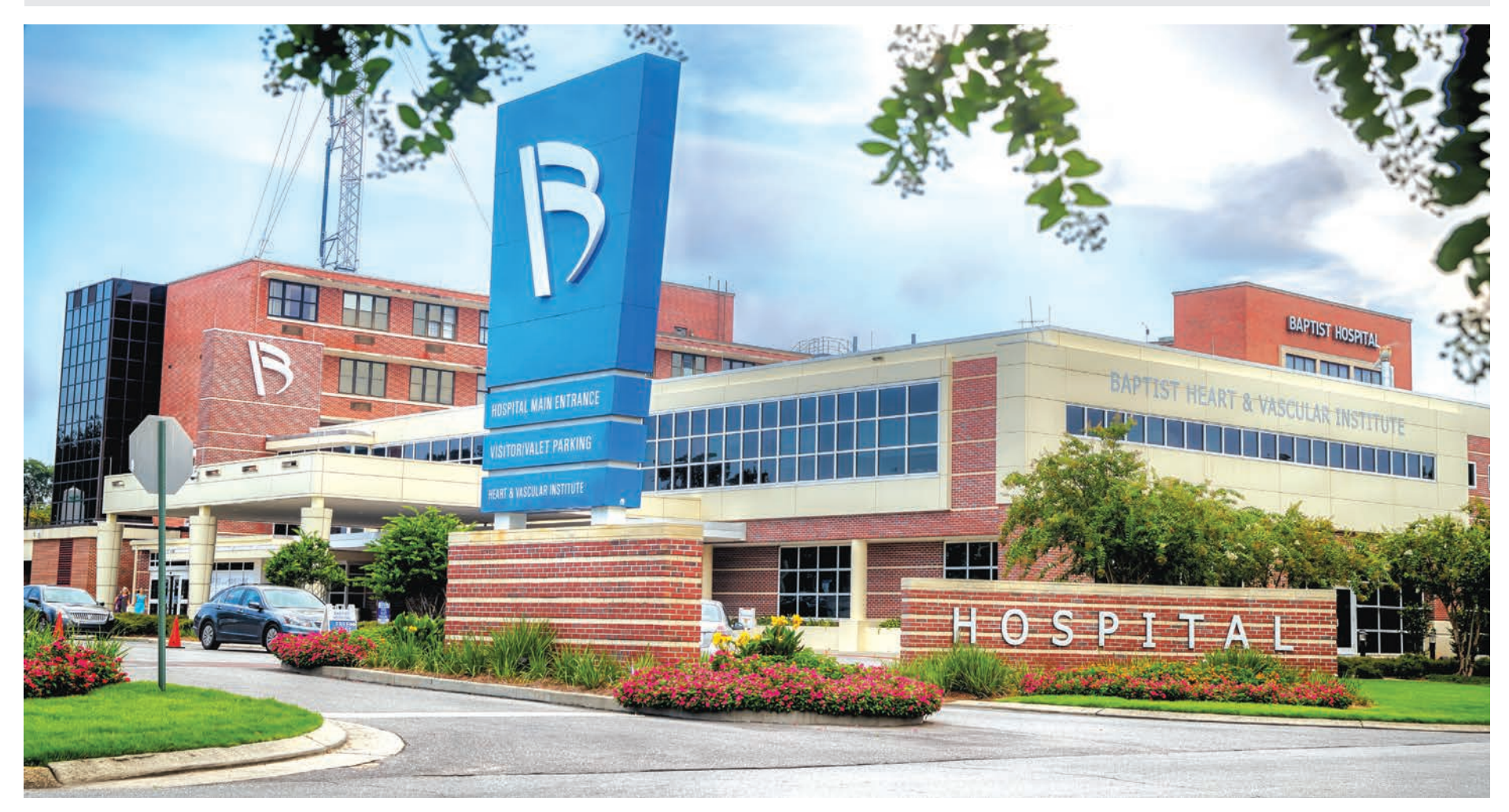
Figure 2: Baptist Heart & Vascular Institute at Baptist Hospital in Pensacola, Florida.