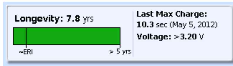
Figure 1: The longevity gauge (in Years).