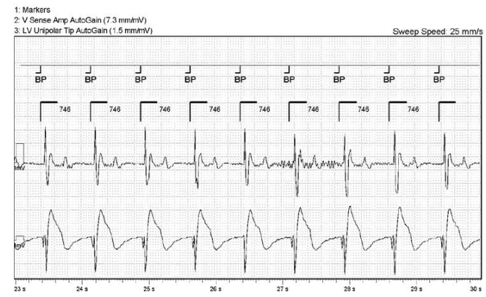
Figure 1. Myopotential signals (~0.8 mV) are oversensed with the LFA on.