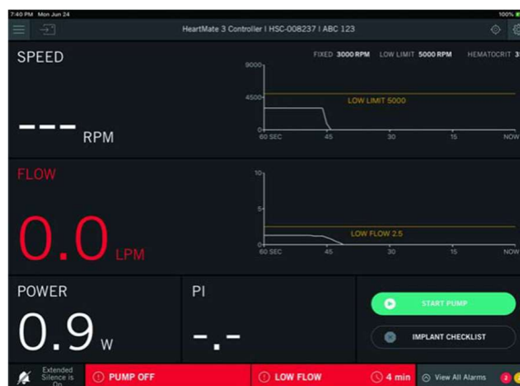
Figure 3: Clinical view after the completion of the “STOP PUMP” sequence.