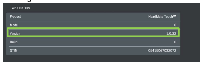
Figure 1: "About" view showing HeartMate Touch Software Version

The software version for the HeartMate Touch App can be confirmed by tapping "Menu" and "About" on the left-hand panel on the HeartMate Touch screen. See Figure 1.