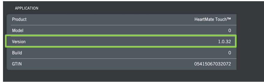
Figure 1: "About" view showing HeartMate Touch Software Version

When the “STOP PUMP” sequence needs to be performed, please follow the instructions in the Instructions For Use (IFU), Chapter 4 HeartMate Touch™ Communication System, Pages 4-59 to 4-60 . The user can prevent the unintentional LVAD start/stop from occurring by following the IFU and these additional guidance and recommendations. Note that communication may also be interrupted if the Wireless Adaptor is disconnected from the HeartMate Touch system prior to completion of the “STOP PUMP” sequence.