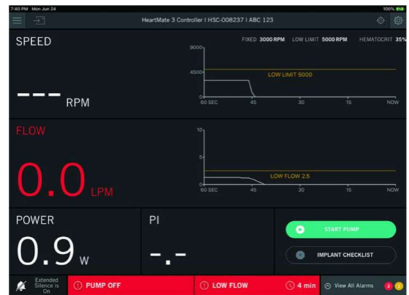
Figure 3: Clinical view after the completion of the “STOP PUMP” sequence.