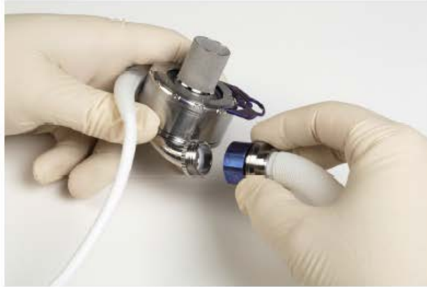
Figure 5.34 Attach the Graft